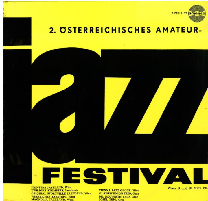
Figure 1: LP cover of the 2. Österreichisches Amateur-Jazzfestival (Amadeo 9107) 8