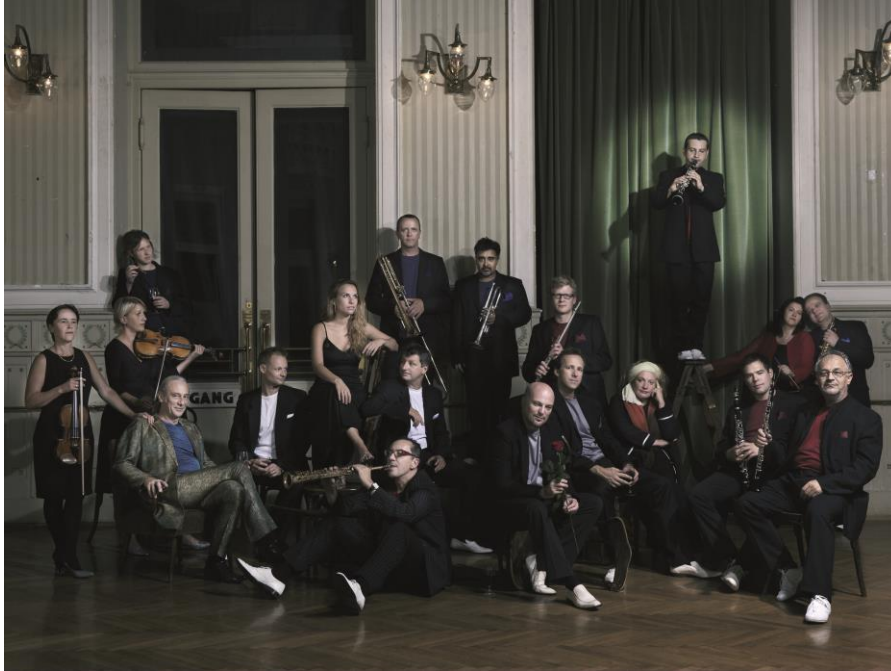
Figure 8: Vienna Art Orchestra 74

harmonically free jazz, incorporating avant-garde concepts and experimental elements. The orchestra achieved international success with programmes like Concerto Piccolo , 75 From No Time to Ragtime , 76 European Songbook , 77 A Centenary Journey , 78 and Art & Fun . 79 Rüegg also included folk (e.g. Swiss Swing 80 ), classical (e.g. From No Art to Mo(z)art , 81 The Minimalism of Erik Satie 82 ), and Viennese elements (e.g. All that Strauss 83 ) in his stylistically varied programmes.